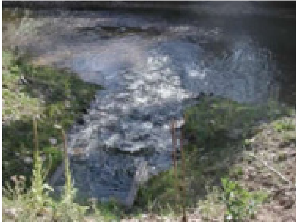
City of Laramie

The Aquifer supplies approximately 50-60% of the City's water supply depending on the time of year and 100% of the water to approximately 450 rural residences in Albany County.